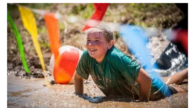
SPLAT! Kids Mud Run

Recreation Services provides a broad spectrum of leisure services to meet the needs of all segments of the community. This includes group and individual programming, recreational trips and classes and special events such as the Heritage Festival (in its 40 th year), the July 4 th "Fire in the Sky" and SPLAT Kids' Mud Run.