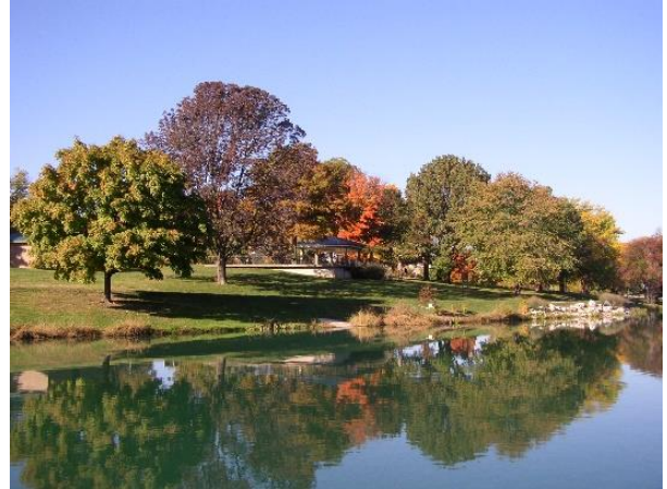
Stephens Lake Park

The Columbia Parks and Recreation Department is seeking an experienced, professional candidate to serve as a Park Planner in the Park Services Division. The successful candidate will support and lead the planning, design and project management of capital improvement projects for the department. The individual will also be responsible for the preparation of conceptual plans, master plans, reports, cost estimates and bidding of materials and services for park projects. Individual will serve as the GIS liaison for the Department and will be required to obtain a valid Small Unmanned Aircraft System (sUAS) license from the Federal Aviation Administration, within 6 months of hire.