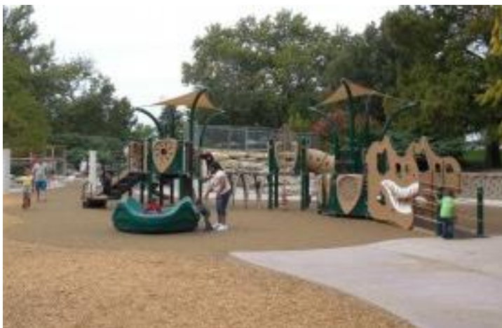
Steinburg Playground in Cosmo Park