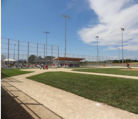
Atkins Memorial Park Baseball Fields