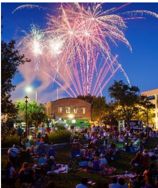
Fire in the Sky

The Columbia Parks and Recreation Department ( https://www.como.gov/ParksandRec/ ) oversees over 3,375 acres of park land and maintains 71 parks, 10 recreation facilities and over 58 miles of trails throughout the city. A wide array of sports, recreation activities, lessons and special events are available for citizens of all ages. Open space, parks and trails provide opportunities to enjoy the natural beauty of Columbia. The 8.9-mile MKT Nature/Fitness Trail connects downtown Columbia with the 240 mile Katy Trail State Park and provides active recreation while preserving large amounts of natural area along the trail.