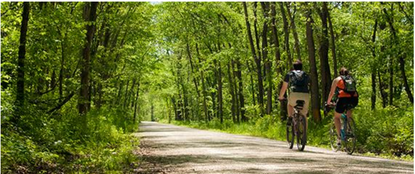
MKT Nature/Fitness Trail