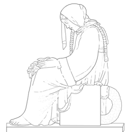
"Remembrance" Flanders Field American Cemetery and Memorial HALS US-7-B