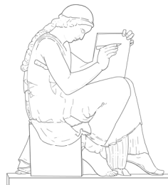
"History" Flanders Field American Cemetery and Memorial, HALS US-7-B