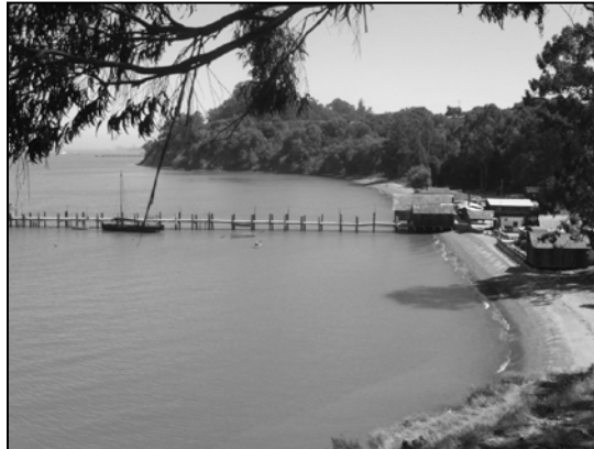
China Camp State Park HALS CA-13