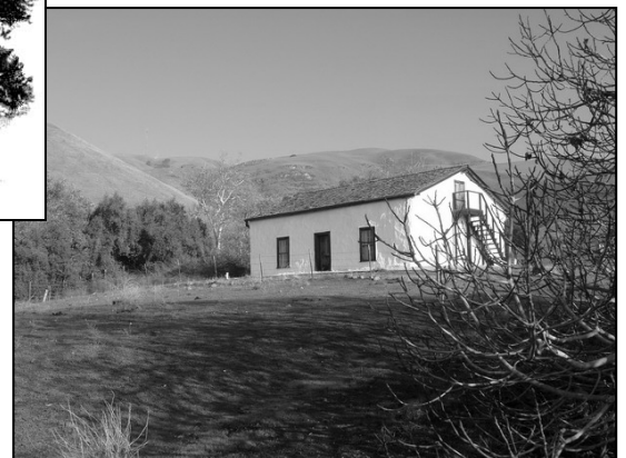
Rancho Higuera State Park HALS CA-10