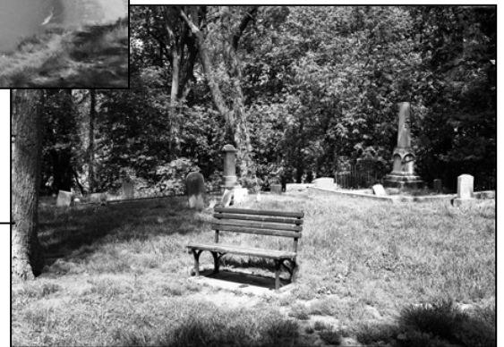
Mount Zion Cemetery / Female Union Band Cemetery HALS DC-15