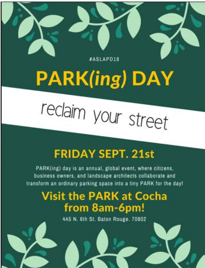
Graphic by Louisiana State University

Advertise your event using your graphic design skills as in these examples: