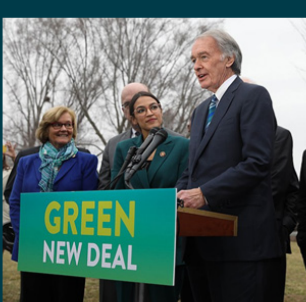
Image: Sen. Ed Markey and Rep. Alexandria Ocasio-Cortez Speak About the Green New Deal

Join the upcoming ASLA webinar on September 30, 2:00pm ET, with Pamela Conrad for a discussion and Q&A addressing Climate Positive Design's Pathfinder tool version 2.0 , and how your firm can step up to the challenge of creating climate positive projects by reducing carbon footprints and increasing sequestration in the places we design. Register now.