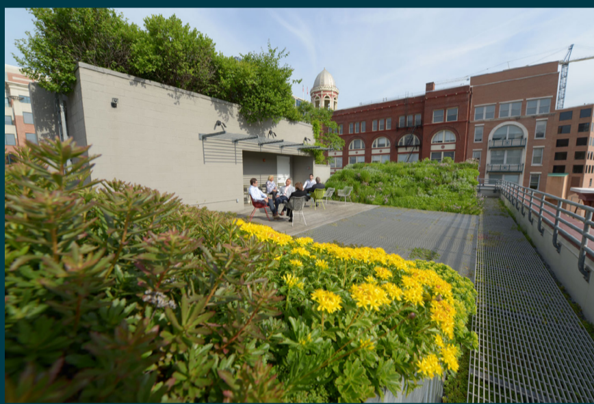
Image: Virtual Meeting Background - ASLA Green Roof by EPNAC

On a more personal level, our Associate Advisory Committee Members are finding some good within the bad and the ugly of this pandemic. While some are loving having more free time and flexible schedules, others are finding it hard to tear themselves away from their desks and remember to pause for breaks and lunch. While some are enjoying more time at home with pets, kids, and spouses, others can't wait for the return of separation of home and work. And of course, we are all dealing with video calls in different ways-- some keep the camera off, others are dressed for the office in a staged room, and the more adventurous have found virtual backgrounds to keep things interesting (like those offered by the ASLA Center here ) Whatever your situation is, we hope that you can find some silver linings too.