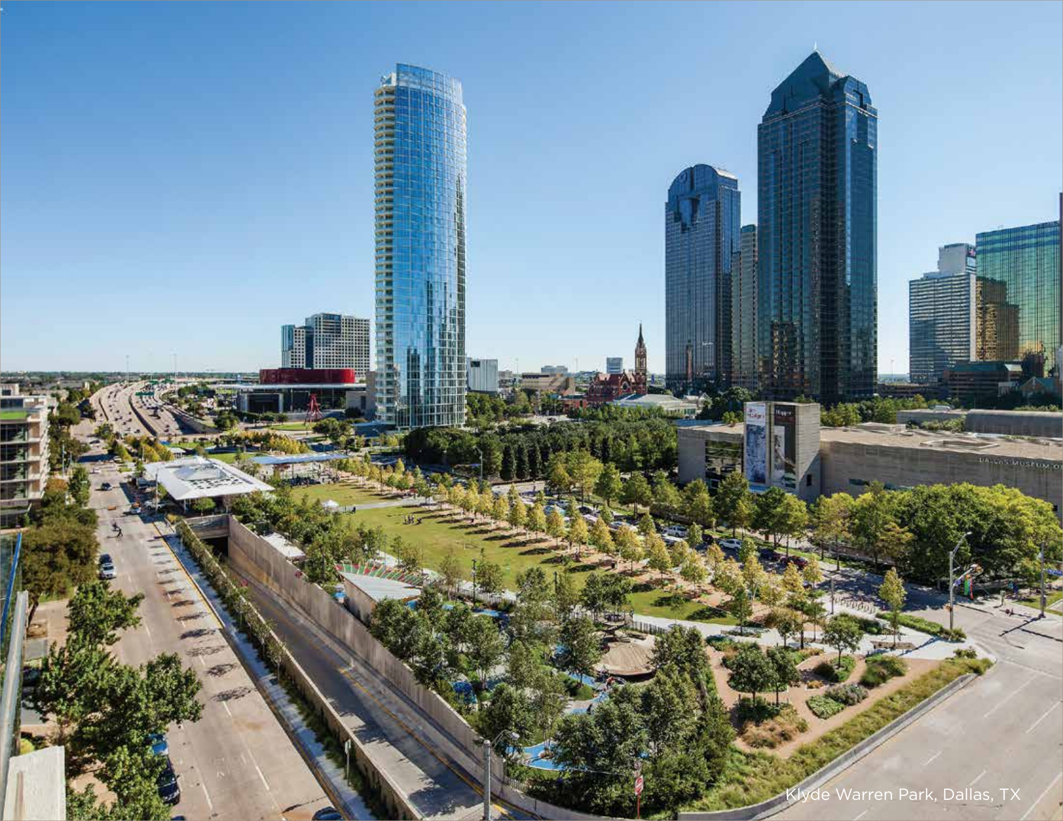
Klyde Warren Park, Dallas, TX