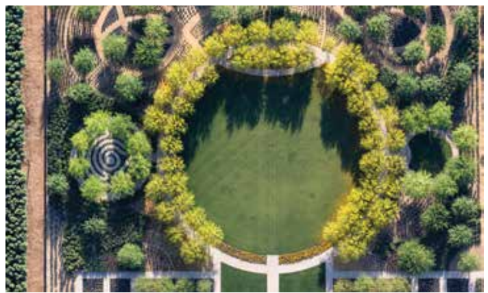
Sunnylands Center and Gardens