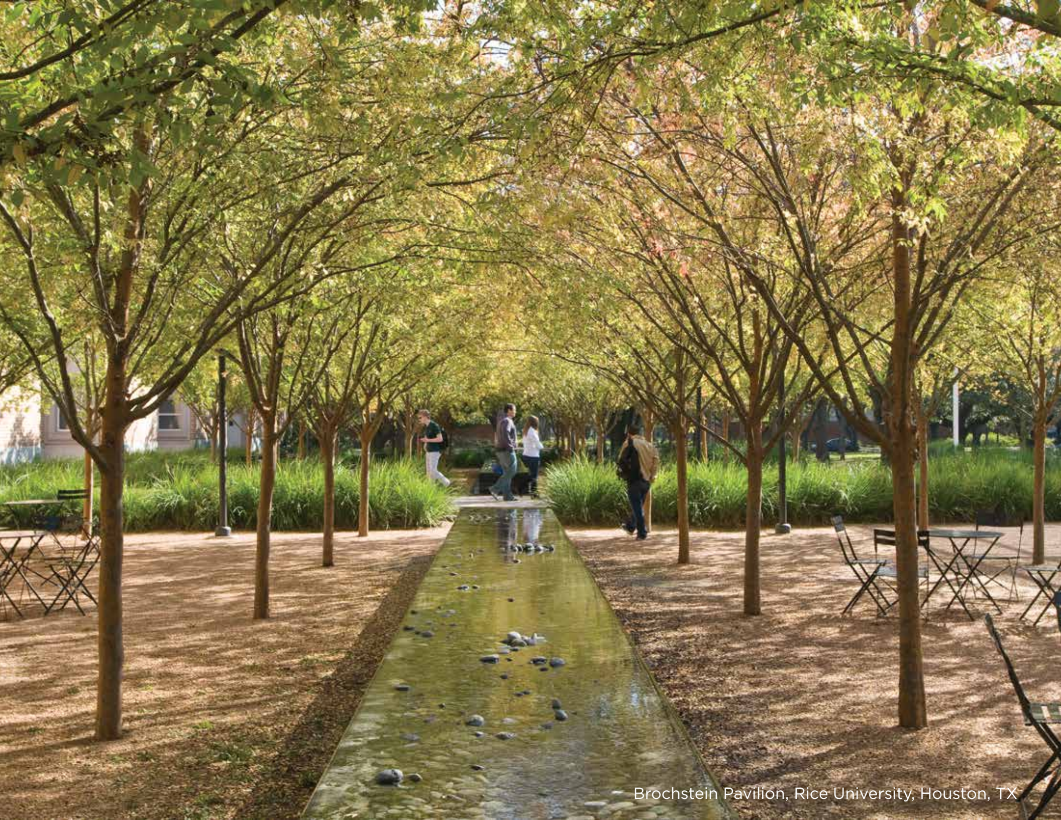
Brochstein Pavilion, Rice University, Houston, TX