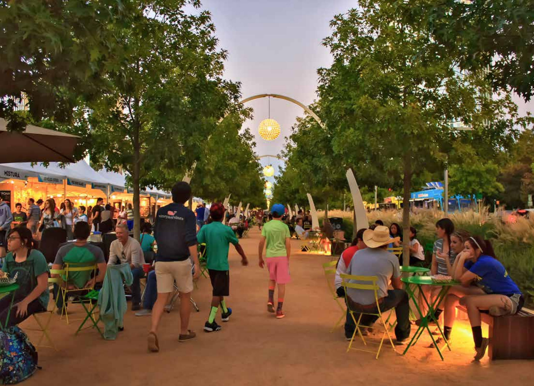
Klyde Warren Park, Dallas, TX