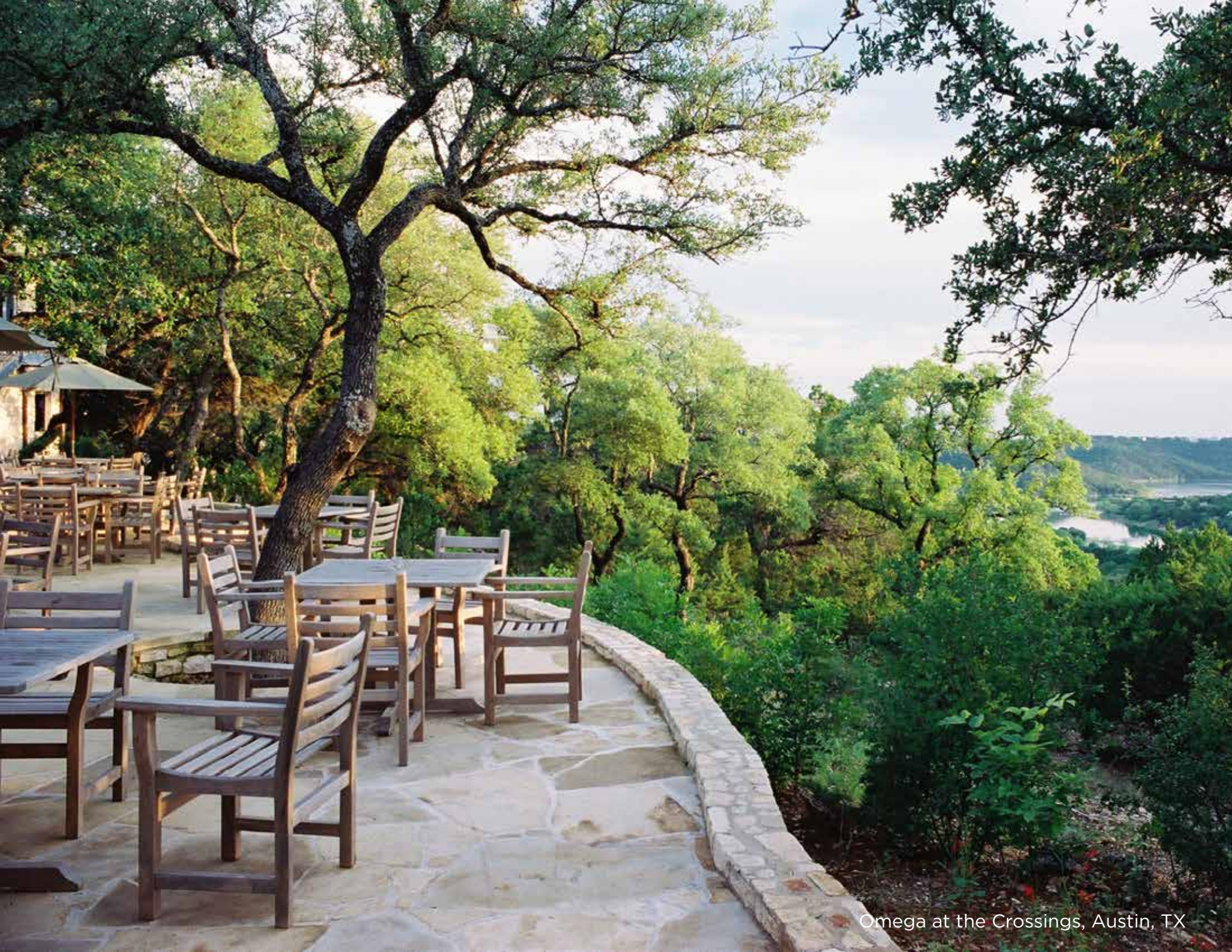
Omega at the Crossings, Austin, TX