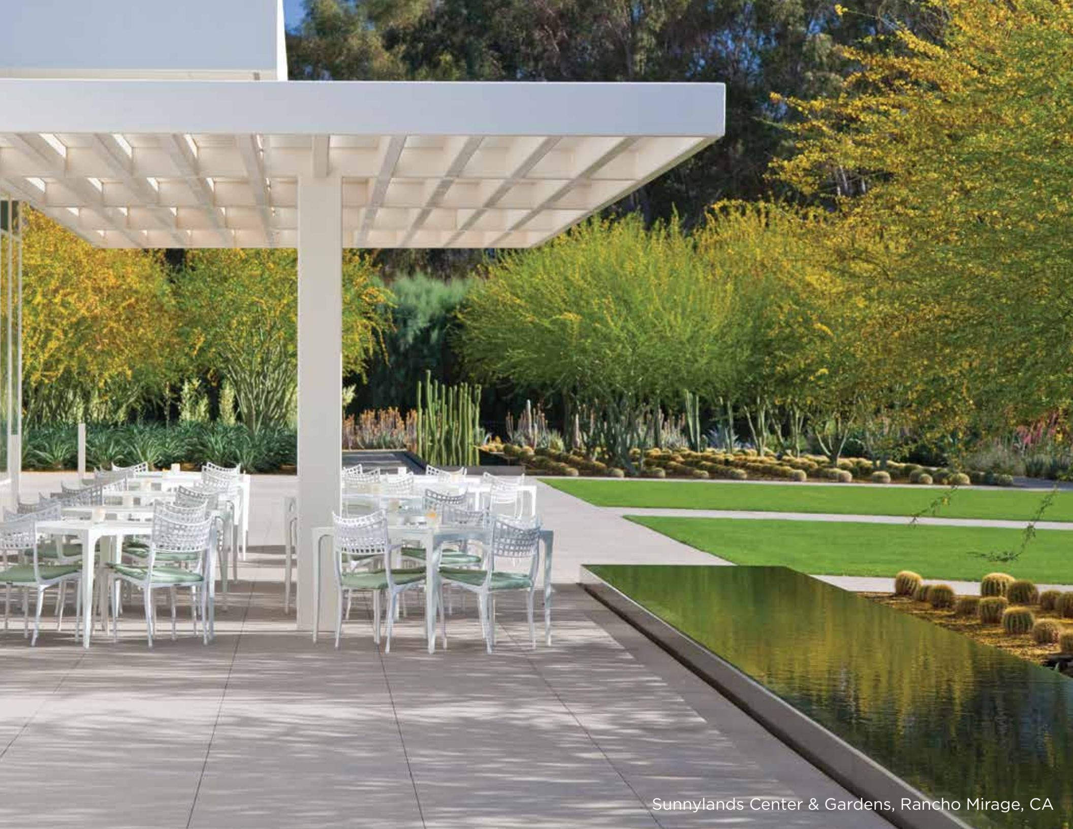
Sunnylands Center & Gardens, Rancho Mirage, CA