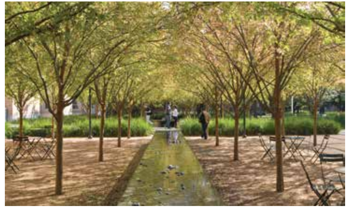
Brochstein Pavilion at Rice University, Houston, TX

OJB’s corporate design initiatives first focus on understanding the client’s business, their challenges and their desired workplace environment. The employee and visitor experience – from the moment they park their car to when they arrive in the office – is meticulously examined and considered. Outdoor meeting spaces are designed for both individual rejuvenation and innovation and group collaboration. Site issues are identified and mitigated, often resulting in multiple on-structure landscape designs, including complex roof gardens and interior courtyards. Integrating these spaces seamlessly into the work environment without being disruptive or distracting requires creativity and a strong grasp of context.