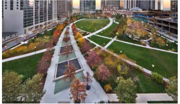
The Park at Lakeshore East, Chicago, IL

OJB has also had a considerable impact in the design of urban and public spaces. OJB believes that landscape and open space are critical to rejuvenating and revitalizing cities and can stimulate economic development and urban growth. Cities are increasingly aware of the importance of providing the urban core with well programmed, beautiful open spaces to attract and retain residents and businesses. OJB's public park projects - including Lakeshore East in Chicago and Klyde Warren Park in Dallas raised the bar for urban open space design. In fact, the Landscape Architecture Foundation