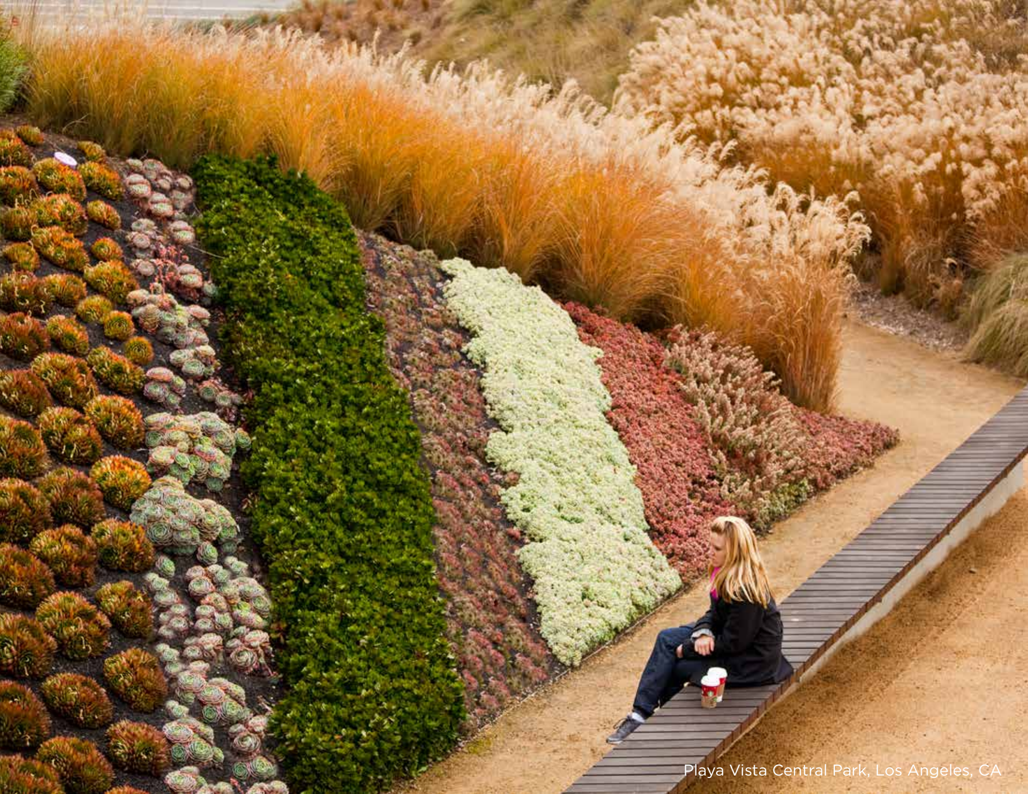
Playa Vista Central Park, Los Angeles, CA