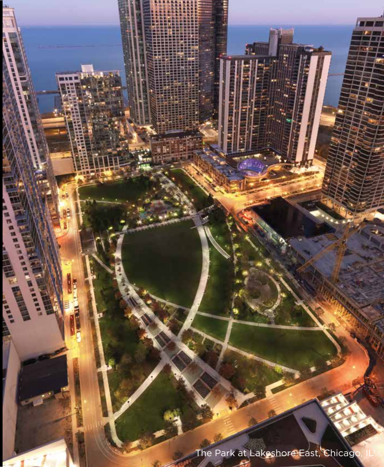
The Park at Lakeshore East, Chicago, IL