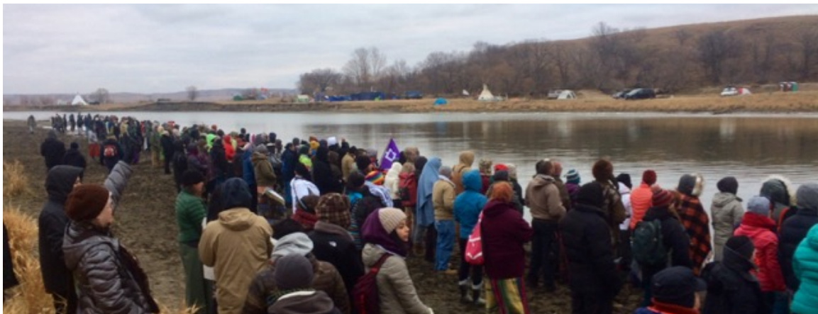
At sunrise on 23 November 2016, hundreds of people braved the cold and wind to pray and pledge their protection for the water that is threatened by the Dakota Access Pipeline. Along with the prayer were inspirational speeches about peace, respect for the land, and humility.

I joined them for three days in November 2016 and was humbled to hear so many people speaking with great passion and dignity of protecting the water, of honoring the land that their ancestors live on, of defending the wildlife from this new invasion on the land they care for.