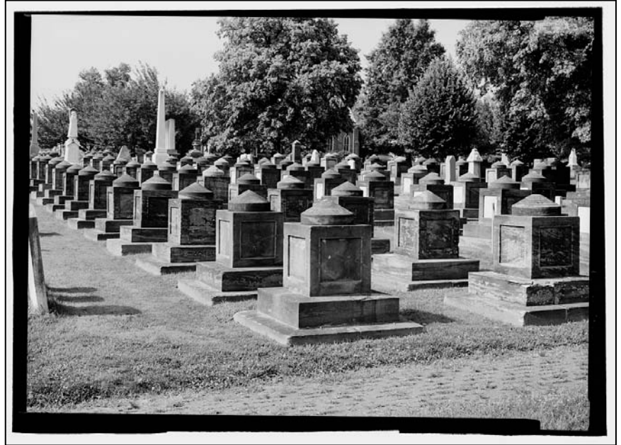
Congressional Cemetery, HALS DC-1-10

Archival standards for the basic durability performance of photographic materials for HALS documentation materials are 500 years. Large format black and white photography when processed to archival standards is believed to meet this standard, while color photography does not. Small and medium format photography is maintained in the HALS collections as part of the field records. The HALS office reserves the right to refuse documentation that does not meet archival requirements for photographic materials. Digital photography is not considered archival at this time. Completed Release and Assignment Form(s) must accompany all donated HALS photographs.