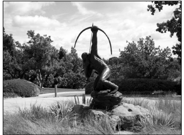
Thomas Gilcrease Estate, HALS OK-25