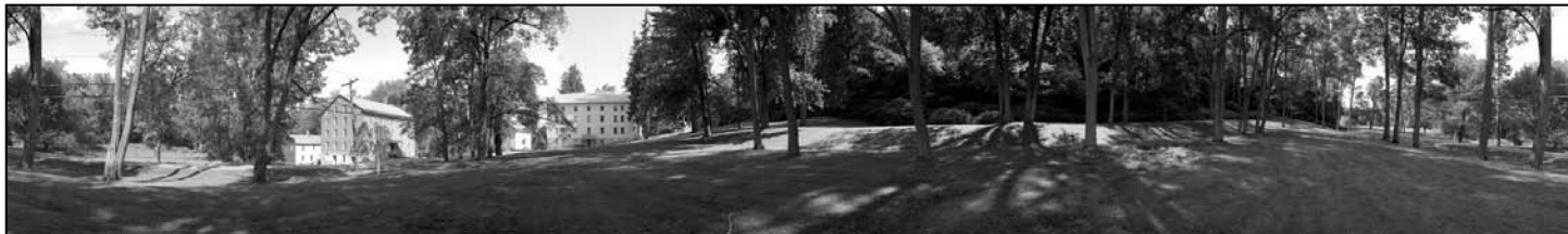
North Family, Mount Lebanon Shaker Village, HALS NY-7

www.nps.gov/history/hps/TPS/briefs/brief36.htm