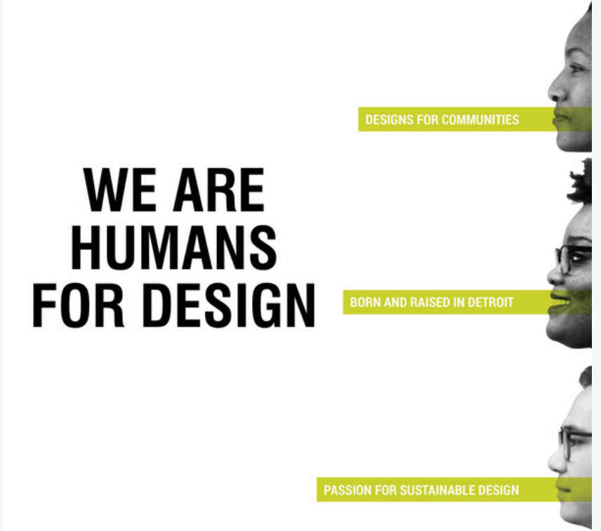
(City of Detroit's Give A Park, Get A Park design competition 2017)