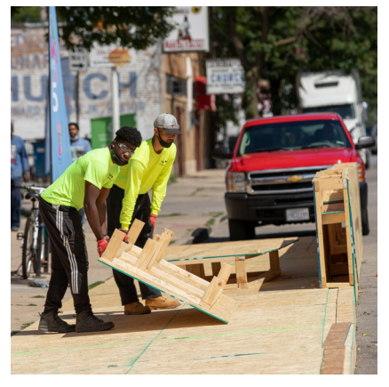
This unique, short-term placemaking and tactical urbanism project activates the public right-ofway by replacing on-street parking spaces with safe outdoor dining and gathering opportunities for adjacent Black-owned businesses and their patrons. Watch the video at:_ http://bit.ly/75thStreetBoardwalk