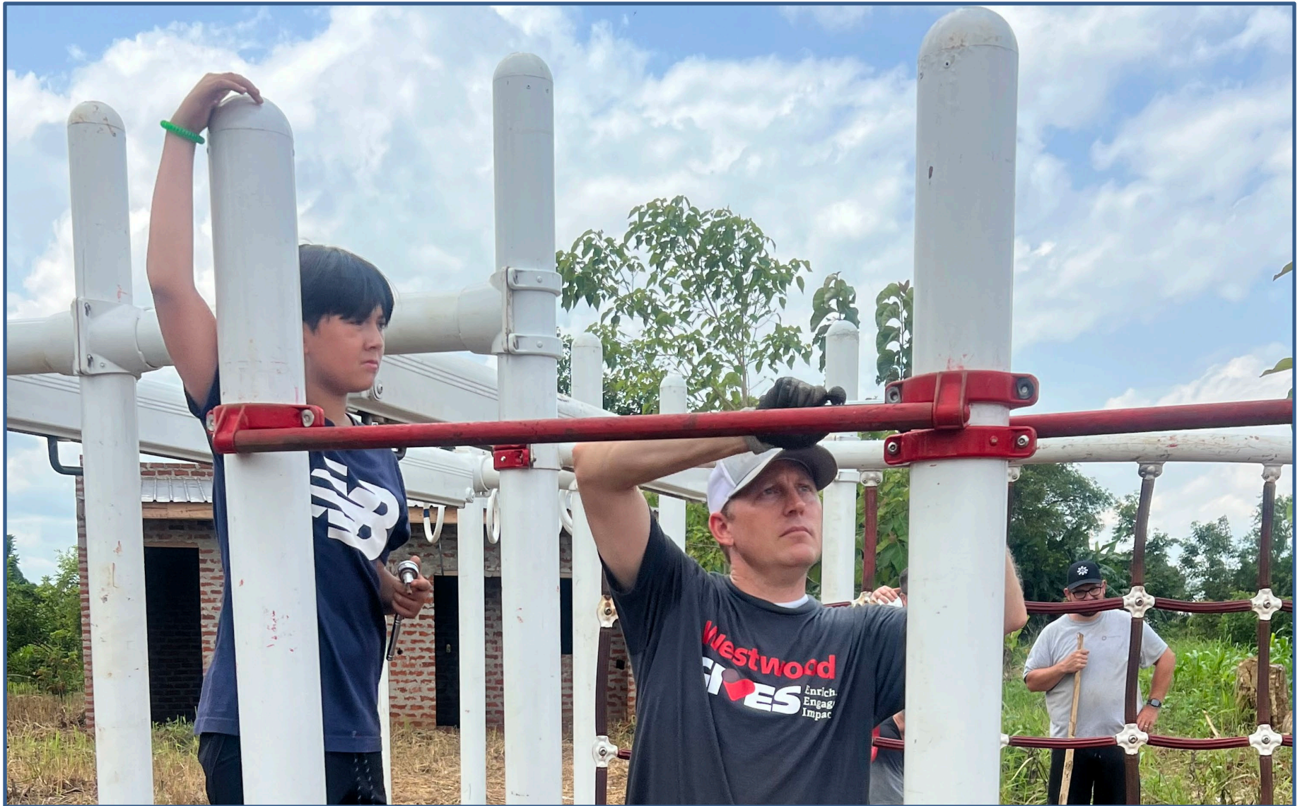
Kennedy Image 07 Ogong Village Playground Construction

This photo was taken on one of the playground structure build days at a small rural village near Gulu Uganda where Chad and his family joined with an organization, Kids Around the World, to build a rare playground for the village.