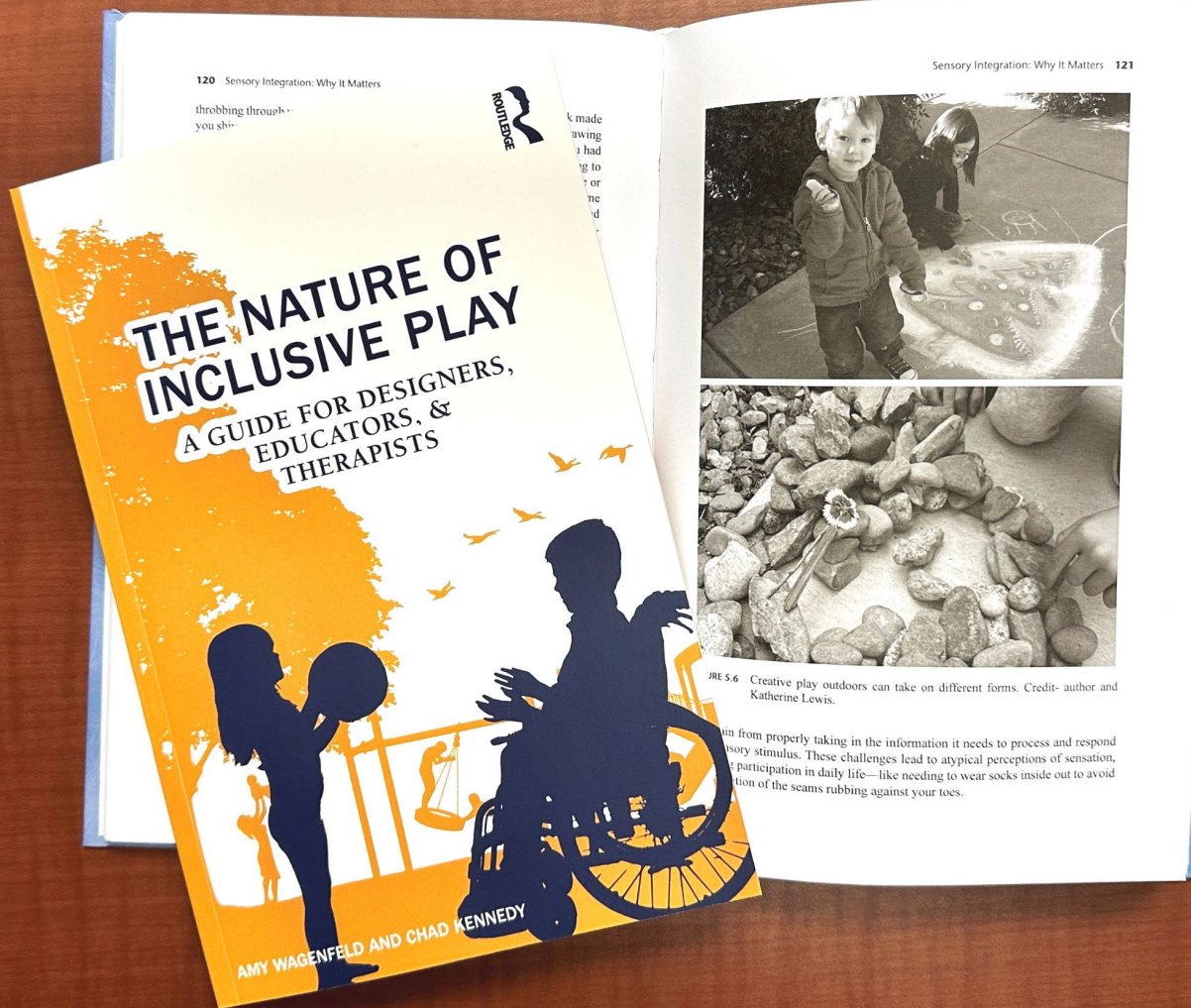
Kennedy Image 02 The Nature of Inclusive Play

Chad recognized a gaping hole in relevant research-based design aids for disability planning, and in an effort completely unattached to seeking profit, he co-authored a 200+ page book specifically for designers, educators, and therapists to educate the public on how to approach inclusive play more holistically.