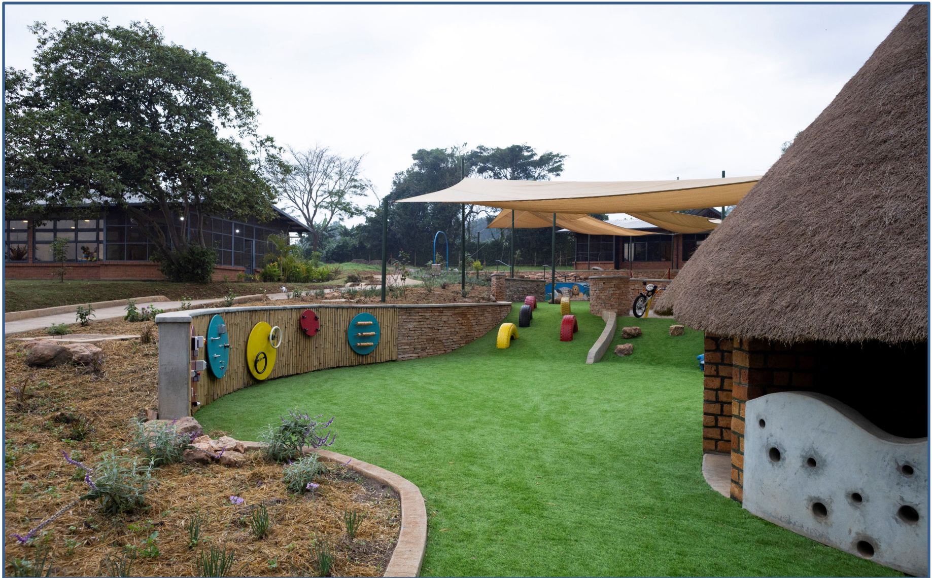
Kennedy Image 05 GEM Village in Uganda (Digital 3D model)

Chad coordinated and worked with a worldwide design team to develop drawings for a playground for children with disabilities in Kakiri Uganda. Typical western equipment and materials are unavailable, so the project faced many challenges meeting safety and accessibility standards. This will set the standard for future playgrounds in Uganda.