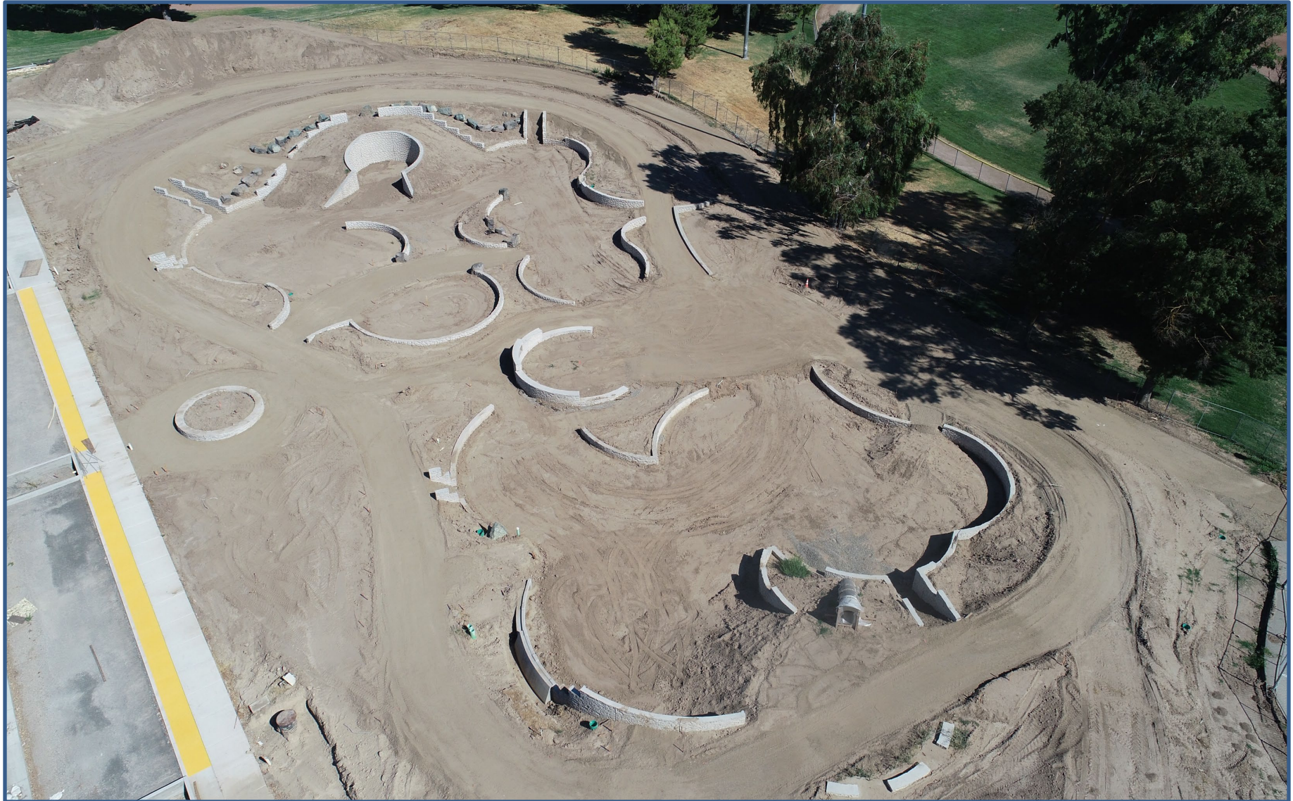
Kennedy Image 04 Awesome Spot Playground (Construction in progress)

Chad took on atypical roles during this project showing that landscape architects can be leaders for positive community change. Pro-bono services included conceptual designs, construction drawings, sponsorship program development, magazine and graphic design services, fundraising assistance, website development and management, public advocacy, grant writing services, construction management, and fund oversight.