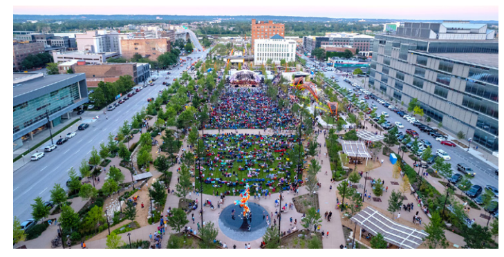
In Omaha, Nebraska, OJB Landscape Architecture designed a space that brings the community together.

Communities are stronger when everyone has the chance to connect with one another. Landscape architects design public spaces, like parks and playgrounds, that bring people together and build a greater sense of community. They understand that people have different needs and design spaces that are accessible and open to everyone.