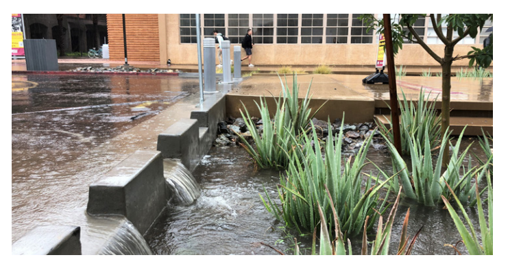
Landscape architects keep students at Arizona State University in Tempe, Arizona safe from dangerous flooding.

Many communities face hazardous flooding when it rains. Other places suffer from droughts. Landscape architects use state-of-the-art technology like pavements that absorb rainfall to keep water off streets. And they deploy time-tested solutions, like rain gardens, that conserve and manage water.