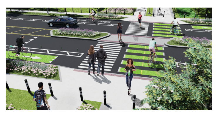
In Detroit, Michigan, SmithGroup designed a street safe for all people.

Landscape architects design networks of bike trails and pathways that encourage people to get moving. They create street plans that make it safer for bikes and pedestrians. They create open spaces, from town squares to massive parks, that help people get fresh air and exercise.