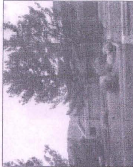
The newly renovated VOCA Community Center, recipient of a Keep Sedona Beautiful, Inc. annual award for exemplary architecture

(3) The exceptional architecture of Tequa Plaza was also presented the KSB Award