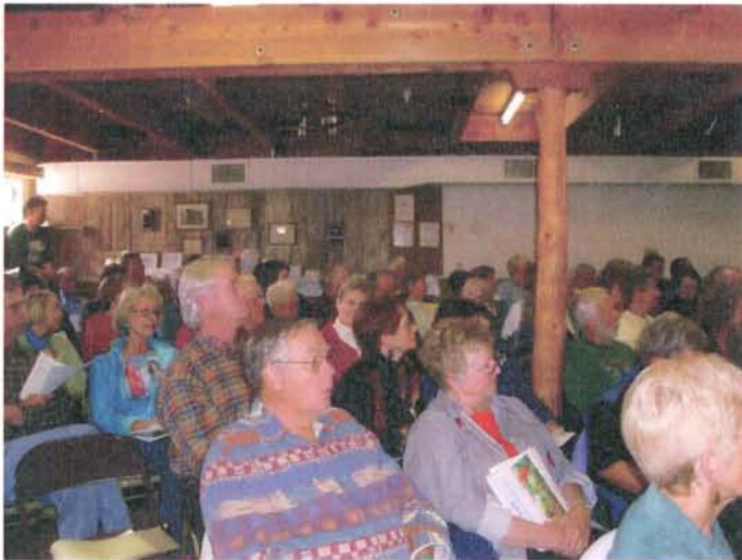
Native Plant Workshop participants 2006