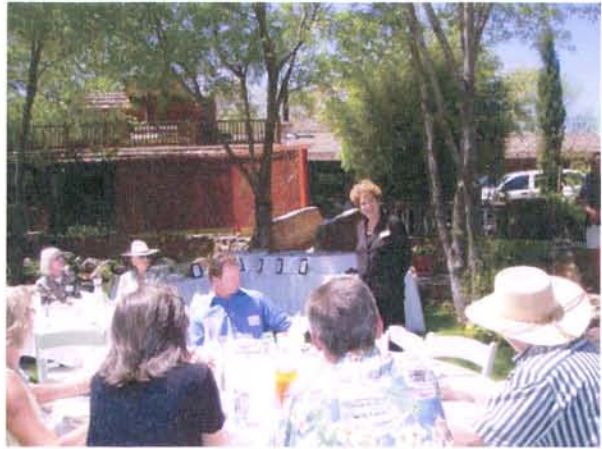
Mayor of Sedona at the 2006 Annual Awards luncheon