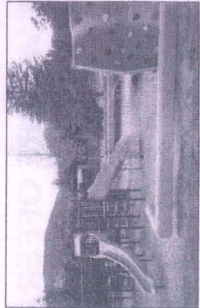
New play equipment at the KSB Award Winning Kiwanis Community Park

Congratulations and thank you to all who have worked to make these excellent projects happen, and therefore, our community a more pleasant and beautiful place to live!