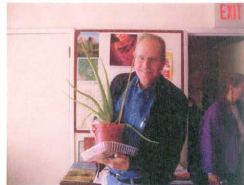
A native plant goes home with a Workshop recipient