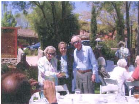
2006 Winners at the Annual Award luncheon