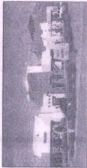
Tequa Plaza, winner of a KSB Award of Excellence for its exceptional architecture

We Village/Big Park folks can feel very proud of three recent honors bestowed on projects in our community by Keep Sedona Beautiful, Inc. (KSB) , Sedona's oldest conservation-oriented organization. For more than 30 years, their Annual Awards of Excellence have been presented to individuals, organizations and businesses for exceptional achievements in architecture, signage and landscape design, as well as exemplary community services, all of which contribute to the goal of "keeping Sedona beautiful."