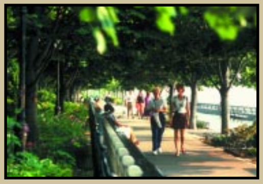
2003 ASLA LANDMARK AWARD BATTERY PARK CITY: MASTER PLAN AND ESPLANADE OLIN PARTNERSHIP, LTD., AND R.M. HANNA LANDSCAPE ARCHITECTS (FORMERLY HANNA/OLIN)