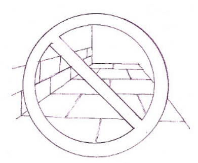
Overly regular materials