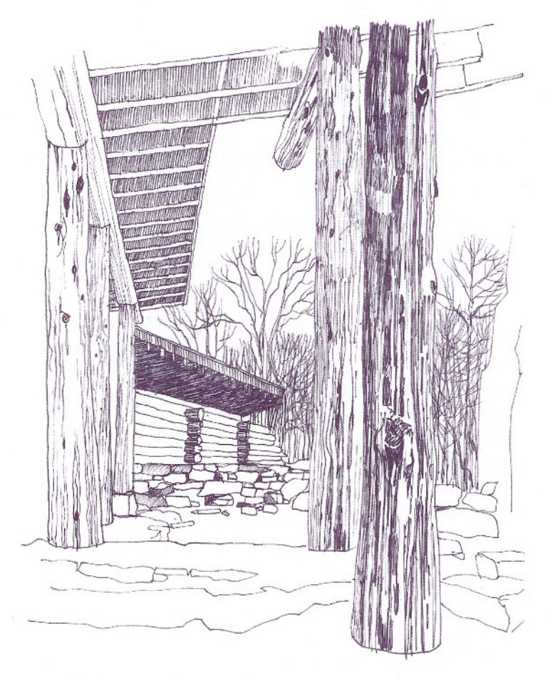
Oversized vertical structural elements