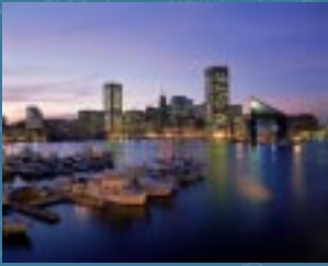
Baltimore Inner Harbor, MD