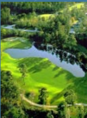
Woodlands New Community, TX