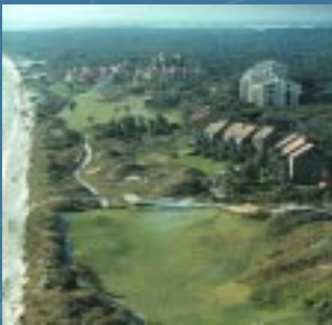
Amelia Island, FL