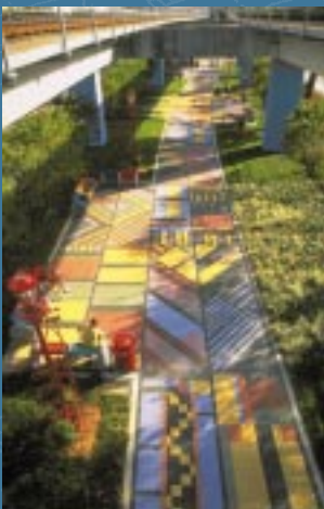
Overtown Mall, FL