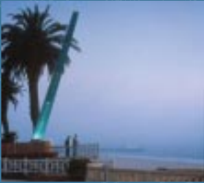
Santa Monica Beach Improvements, CA