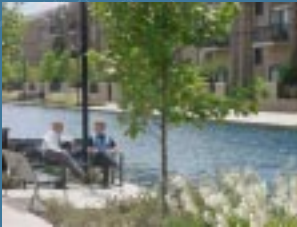
Capital City Landing - North Extension, IN