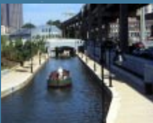
Richmond Canalwalk, VA