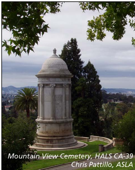
Where is Information on Documenting Historic Landscapes?

The National Park Service Heritage Documentation Program website ( www.nps.gov/hdp/ ) provides detailed guidelines for producing landscape architectural measured drawings, large-format photography, and written history reports according to HABS/HAER/HALS standards. Documentation produced through the programs constitutes the nation's largest archive of historic architectural, engineering, and landscape documentation. Records on over 40,000 historic sites are maintained in a special collection in the Prints and Photographs Division of the Library of Congress and are available to the public copyright free in both hard copy (in the Library of Congress) and digital (via the Web) formats ( www.loc.gov/pictures/collection/hh/ ).