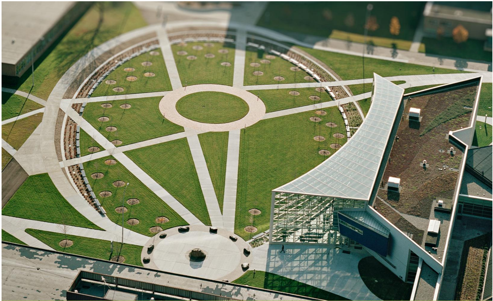
Figure 1- Quadrangle features a perimeter bioswale, geothermal field of 100+ wells beneath it, adjacent green roof with gray water cistern below grade for toilet flushing

Email: mehieber@hede.com ASLA Chapter: Michigan